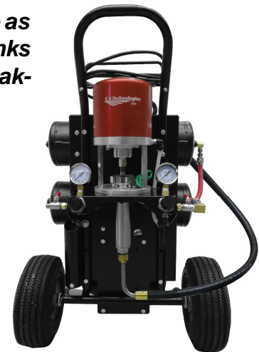
OB14-PC & OC14-PC

"Bringing portability to the market of fine finishing"